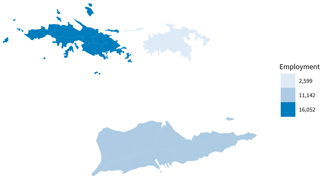
Figure 3: US Virgin Islands Employment by Municipality, 2017.